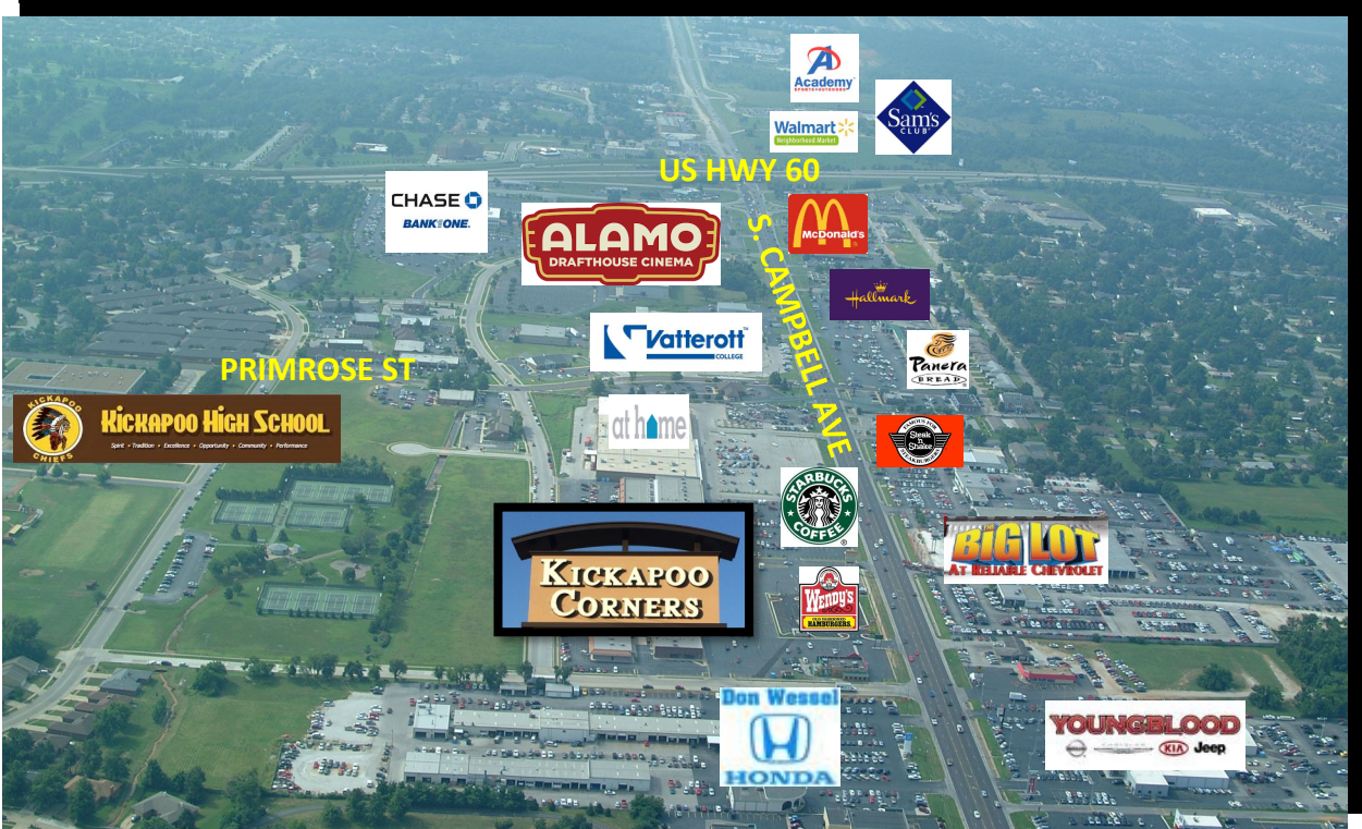
Kickapoo Corners View to the South