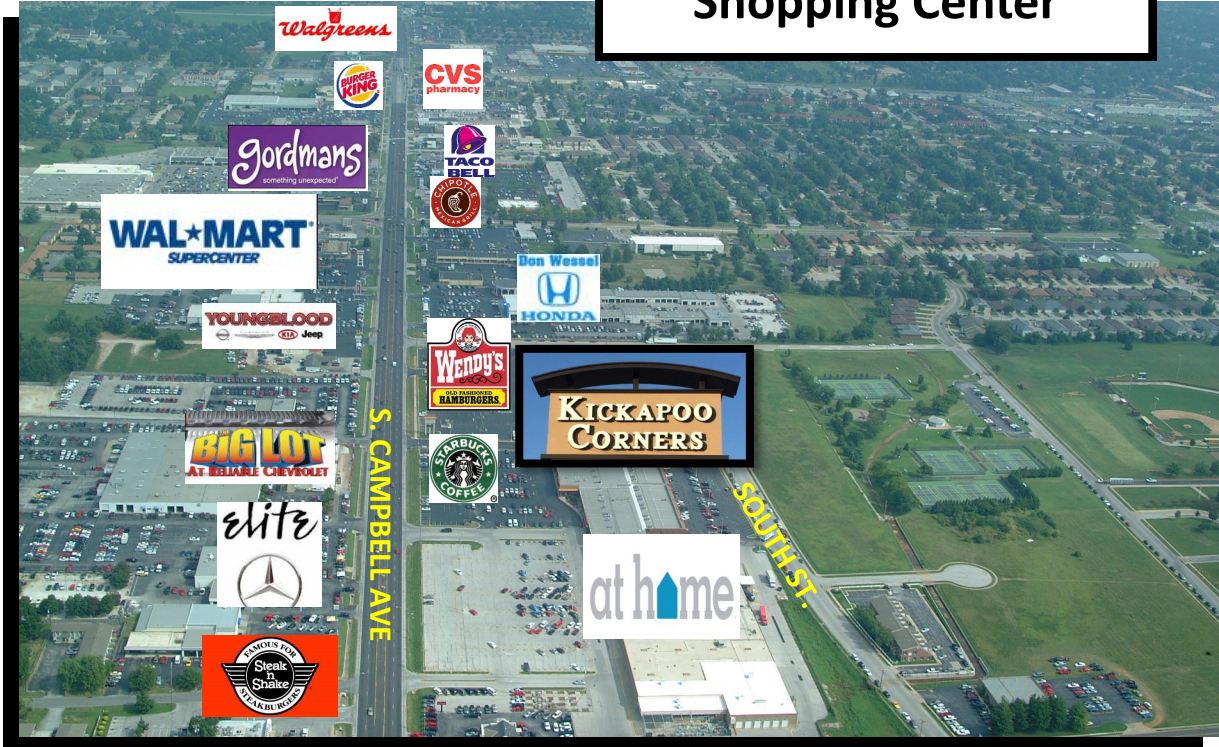
Kickapoo Corners View to the North